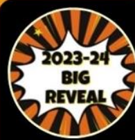
Coming Soon Speaker Series Fall 2023-Spring 2024

Flagler Tiger Bay Club is a nonpartisan club that caters to a diverse group of members. Our members have a keen interest in politics, things that affect politics, civic, and other current event issues that impact and shape our daily lives.